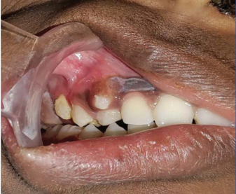
[Table/Fig-7]: Follow-up after 10 days, healing tissues can be observed. [Table/Fig-8]: Follow-up after three months, complete healing can be observed. (Images from left to right)