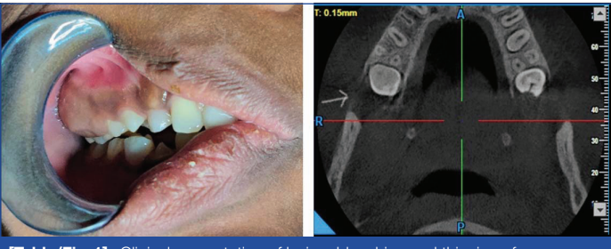
[Table/Fig-1]: Clinical presentation of lesion; blanching and thinning of mucosa can be observed. [Table/Fig-2]: CBCT showing radiolucent unilateral lesion on right side in posterior maxillary region. (Images from left to right)

A full thickness flap was raised to expose the lesion adequately. Using a bone cutting carbide bur no. 702 SS white, the bony growth